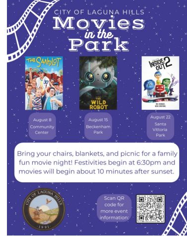
Movies in the Park