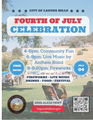
4th of July Celebration