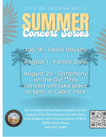
Concerts in the Park